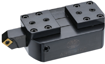
ABST 粗搪刀組 ABST Single-bit Rough Boring Head